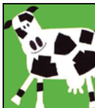
EVERY PICTURE TELLS